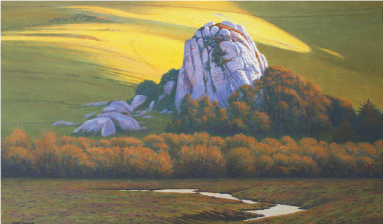
Robert Reynolds, Icon/West Light , acrylic on canvas, 36 x 24 inches

Free artist's link for all SLOMA members Send your web address and a short description of your media to news@sloma.org Read your Art News online and save the Museum the expense of printing and mailing. To go green, please e-mail news@sloma.org requesting the E-Art News. Thanks for going green! Addresssee or Current Resident