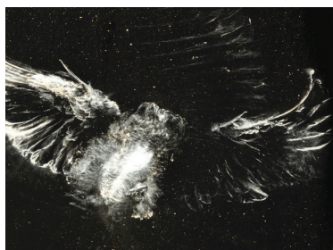
Judith Hildinger, 2012 First Place

This exhibit features the winning images from the 18th Annual New Times Photography Contest.