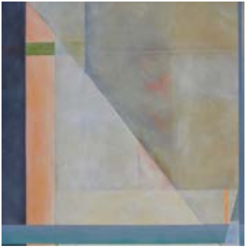
Jeanne Obermeier, Sangre de Cristo, acrylic on canvas, 42 x 42 inches, selected for Brushstrokes 2015

Members-only opportunity to preview exhibitions before the opening night crowds: Friday, March 6 at 5 to 6 pm. Art After Dark public gallery walk happens 6 to 9 pm.