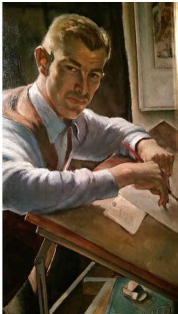
Phil Paradise, Carl (detail)

From May 22 to July 19, 2015, it's all about the permanent collection of the San Luis Obispo Museum of Art! A Closer Look will feature paintings, works on paper, and recent acquisitions that exhibit its variety and depth. It is also a look at the people and forces that created the Museum of Art, how it has evolved, and where it is headed in the future.